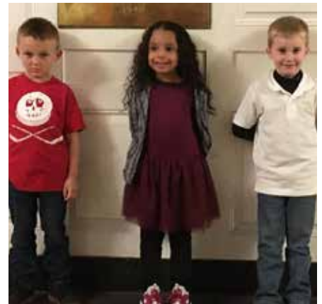
Three Kindergarten students represented all of the class of 2030 to present the artwork to the Board of Education.

As part of a new local initiative, WCSD Kindergarten teachers